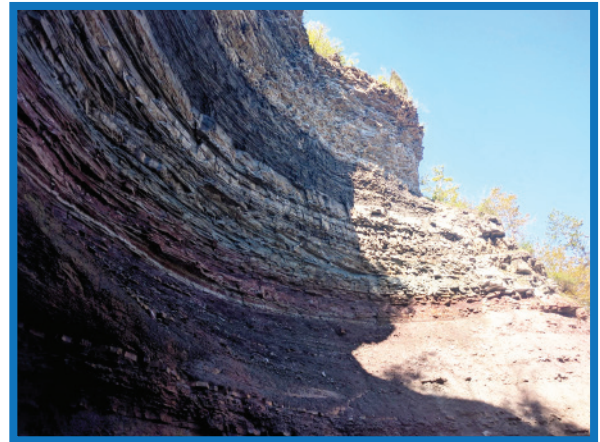
Sedimentary rock layers in the Niagara region

One of the most important dating principles is the Law of Superposition. This law states that, within horizontal strata, younger rock layers are deposited on top of older ones. An easy way to envision this is to think about a lasagna: you know the bottom layer had to be first, and that each additional layer came after, with the melted cheese on the top.