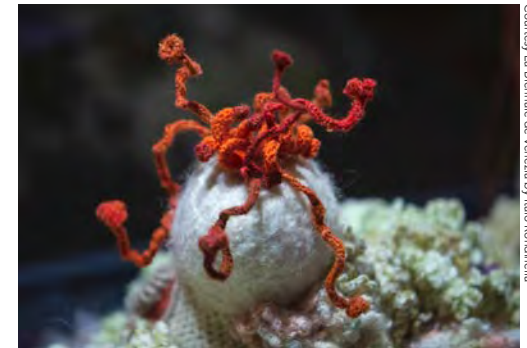
Bleached Reef at the 2019 Venice Biennale

Just as the diversity of living species results from variations in an underlying DNA code, so a wide range of woolen 'species' may be brought into being through modifications in an underlying crochet code. As in nature, organic-looking structures are 'born' from variation and experiment. Anyone who takes up this technique can begin to explore what is possible here. So, have fun. Go wild. Be part of an ever-evolving crochet 'tree of life.'