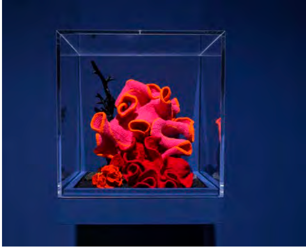
Pod World – Hyperbolic at the 2019 Venice Biennale

The Crochet Coral Reef is a celebration of the intersection of geometry and handicraft and a testimony to the disappearing wonders of the marine world. Launched as a response to the devastation of living reefs due to global warming and ocean acidification, the Crochet Reef resides at the nexus of art, science, mathematics and environmentalism.