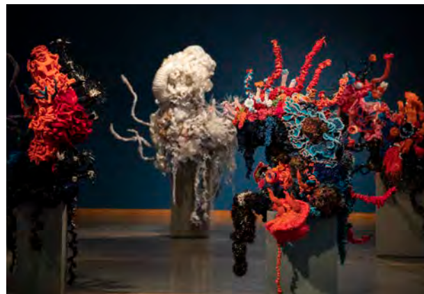
Coral Forest at Lehigh University Art Galleries, 2019

to a mathematically pure pattern, they began to use more freeform techniques which give the models a natural, organic look. Tightly bunched mounds of brain coral, towered spires of pillar coral, blooms of carnation coral and forests of kelp can all be mimicked.