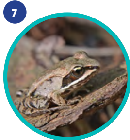
Wood Frog [Land]