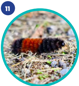
Woolly Bear Caterpillar