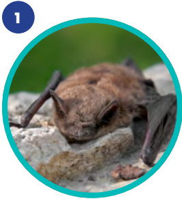
Little Brown Bat