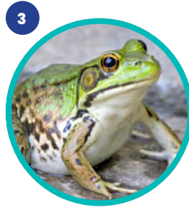
Green Frog [Aquatic]