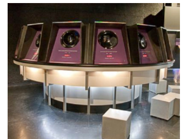
Solar System Orrery