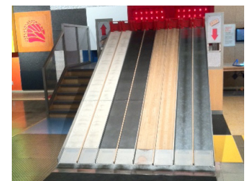
Race Against Resistance