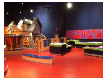
Be a Builder