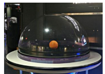
Earth Moon Sun